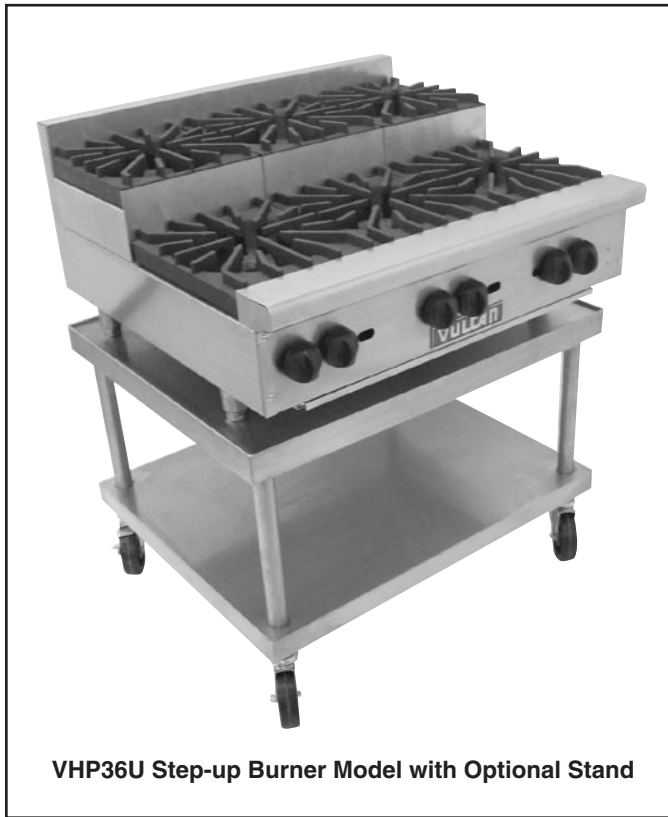
VHP36U Step-up Burner Model with Optional Stand