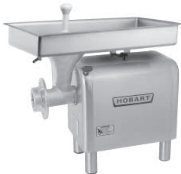
4822 with Optional Funnel Shaped Cylinder